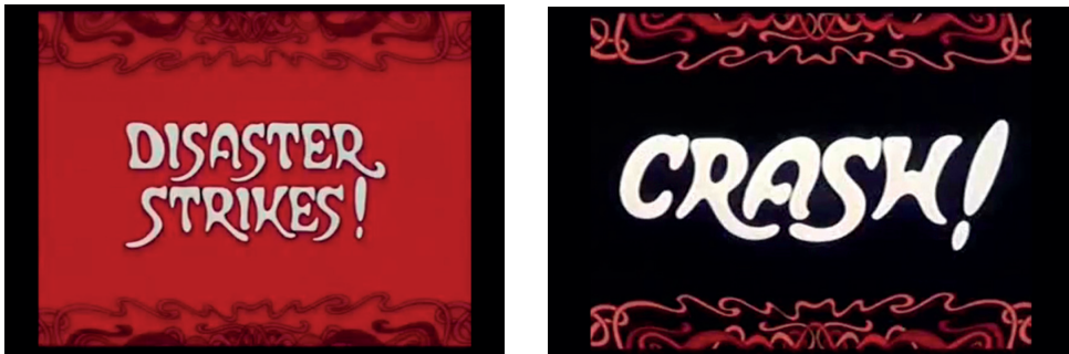
Figure 1. Intertitles from the movie The Wrong Box (Forbes 1966)

Contrariwise, Forbes shows fascination with intertitles, never doubting the power of this filmic instrument. In his adaptation, he sporadically inserts some brief remarks and exclamatory words or phrases, such as “DISASTER STRIKES!” or “CRASH!” (Fig. 1) to add a dramatic emphasis which, taking into consideration the absurdity of the story, makes the scenes even funnier. To be more precise, here the intertitles serve as means of farcical stylisation. Consider: