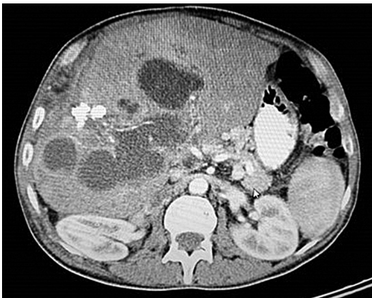
Figure 1. CT scan

The patient underwent surgery and the hydatid cysts located in the right lobe of the liver were unroofed and the inner surface was rinsed with savlon solution. Afterwards, anterior and posterior parts of the left portal vein were examined. The parenchyma of the liver was incised and thrombotic right and middle hepatic veins were ligated. Right hepatectomy was performed over caval vein. The lumen of the portal vein was opened and no portal blood flow was seen (Figure 2).