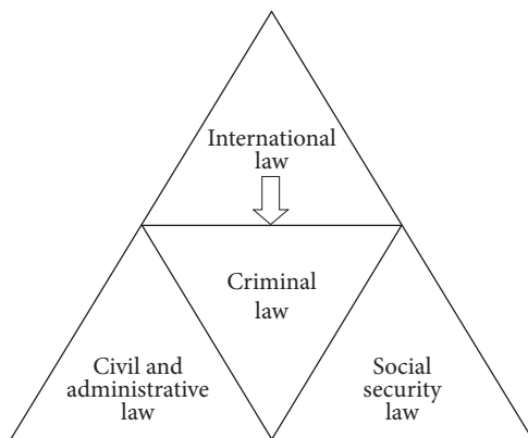
SCHEME No. 1. The static interrelation of laws regulating domestic violence.

In order to imagine the complex legal regulation of domestic violence, a simplified scheme is presented.