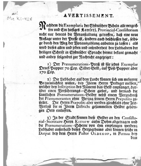
Subscription advertisement of Estonian language Bible