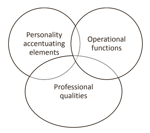
Figure 1. Competence structure for preschool teachers.

The structure of each teacher's competence consists of the three components, but their weight differs. The most important component is their professional qualities. A teacher's reflective activity is important in education. By including self-assessment in teacher education curricula, prospective teachers are encouraged to ask themselves questions about the nature of learning, the impact of experience on further learning, how to make their learning more productive and how to explore their performance for improvement. As a result, it is easier for them to understand what and how they are doing as teachers, and they are able to see both successes and failures without fear of acknowledging that there are things they do not yet know and would be willing to learn from their own experience (Latkovska, 2015). Self-assessment is important for each student's study progress and dynamic development of competencies.