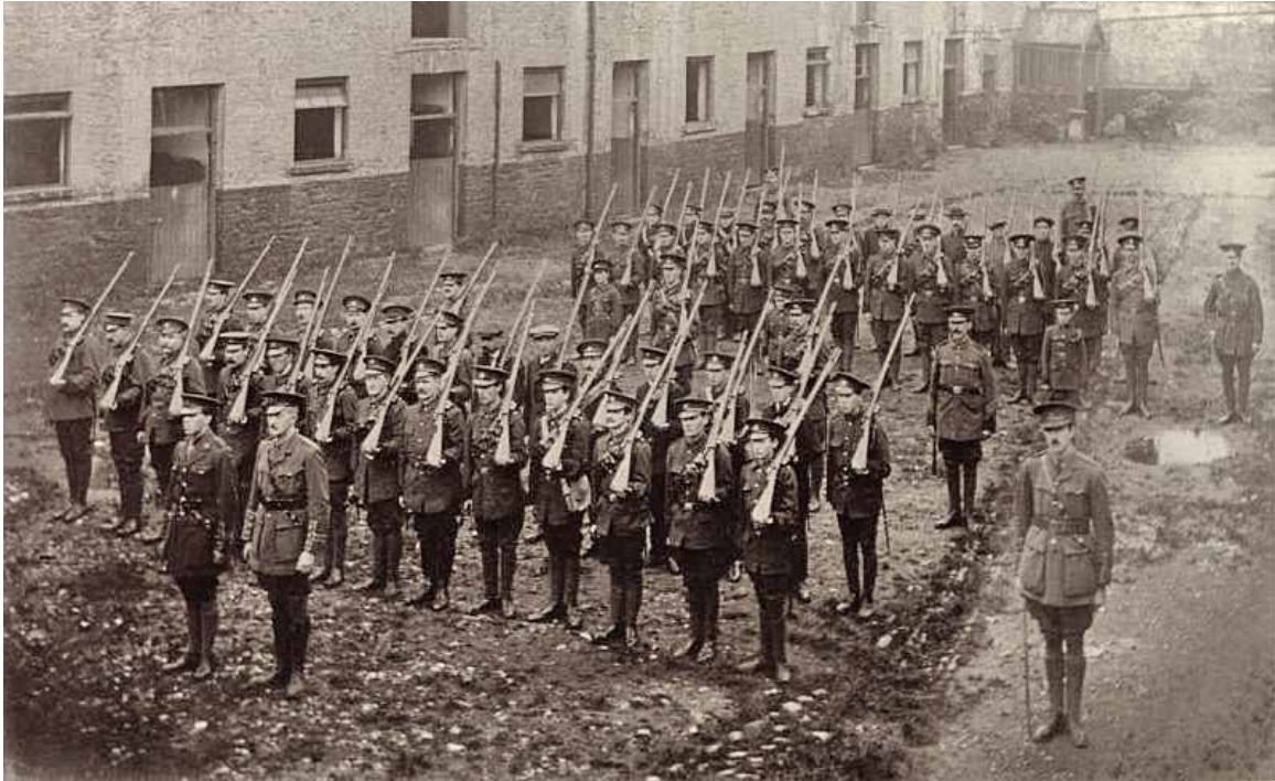
Fig. 3. Photograph of National Volunteers with Vetterli Rifles.

Irish National Volunteers on parade with their Vetterli-Vitali M1870/87 Italian rifles. Although many sources cite the use of these weapons during the Easter Rising, only a handful of the Irish Volunteers actually carried them, as ammunition for these obsolete rifles was in very short supply.