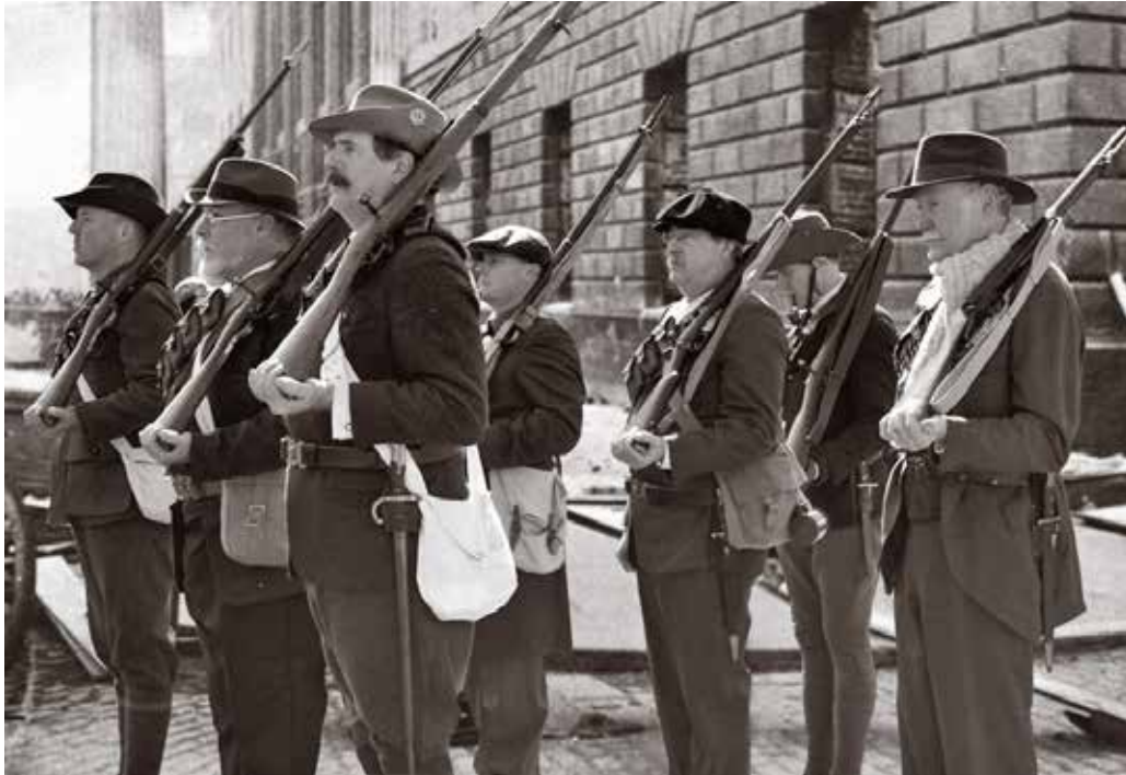
Fig. 2. Photograph of living history participants set against original photograph of the GPO.

In this modern photocomposition, living history re-enactors are carrying typical rifles used by the Irish Volunteers in the Easter Rising. These include “Howth” Mausers, Long Lee Enfields, Martini-Enfields, and Boer Mausers.