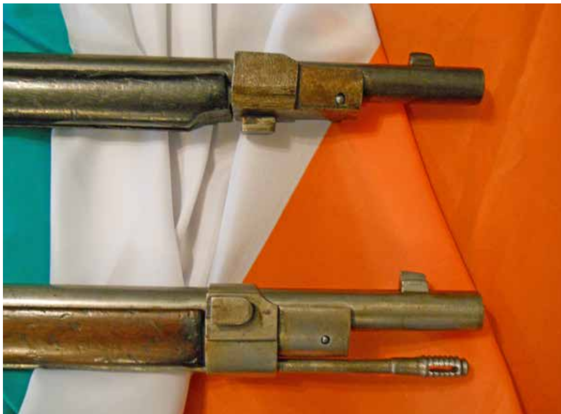
Fig. 6. Photograph of M1871 Mauser fore end cap.

The Irish Volunteers bought bayonets for their “Howth” Mausers, but they were the wrong bayonets - both M1866 Chassepot and M1874 French Gras bayonets. Many of the bayonets were altered to fit the rifles, but the rifle seen at the top (also acquired from Interarms) has had the bayonet lug crudely altered to fit the bayonet. Research is ongoing to determine whether Interarms imported actual “Howth” Mausers in the 1960s.