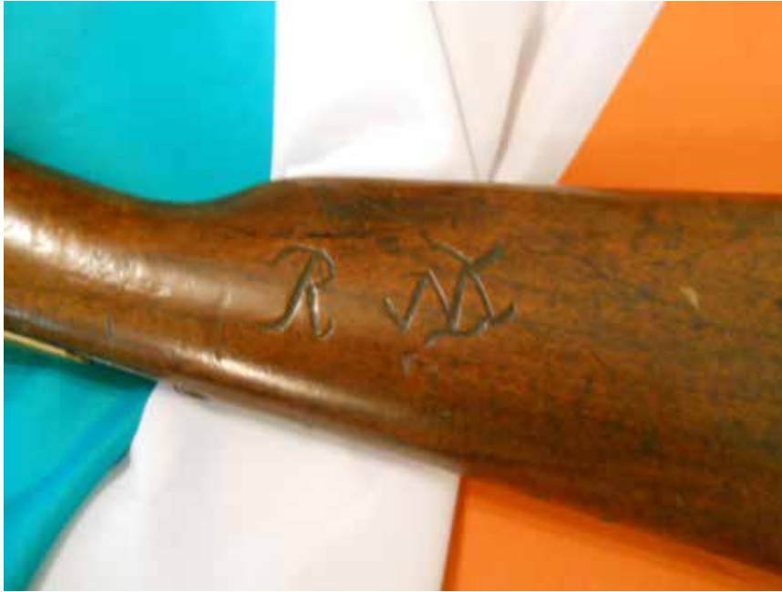
Fig. 7. Photograph of M1871 Mauser stock carving.