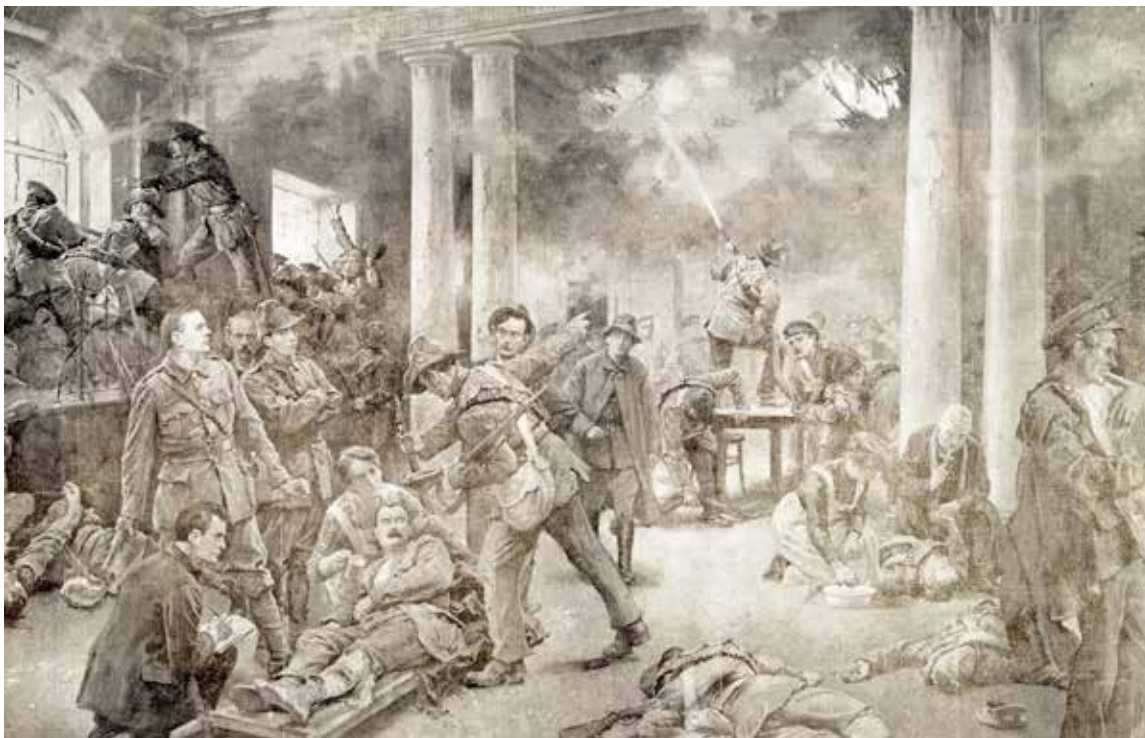
Fig. 1. Sepia rotogravure of 'Birth of the Irish Republic' by Walter Paget.

In this rotogravure of Walter Paget's masterpiece, 'Birth of the Irish Republic', the leaders of the Easter Rising are grouped around James Connolly of the Irish Citizen Army (on stretcher) during the last hours of the rebels' defence of Dublin's General Post Office. Although the artist depicted British mounted infantry style bandoliers being worn by many of the Irish Volunteers, they were a rarity in the Easter Rising.