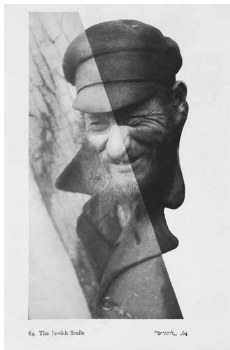
4. The Jewish Smile (Fig. 64).

It is therefore possible to identify several semantic layers that are combined in Vorobeichic's book in a visual and textual experiment. One of the layers is the discourse of authentic modernisation of the Lithuanian Jerusalem, which can be called simply the Yung Vilne discourse. It is a visual narrative about the emancipation of the old, centuries-long Litvak tradition, which suffered poverty and humiliation, but was nonetheless transformed into a modern culture that was confident and open to the future. A love for Vilnius' historic spaces and local patriotism were inseparable from exposure of the poverty in the Jewish quarter, sharp social criticism, and the pain of human existence, all of which also characterised Yung Vilne poetry, prose and fine art. However, the significance of the poverty depends on the perspective: the poverty of Vilnius' Jewish quarter may also entail the beginnings of a creative rebirth. In Vorobeichic's book, this hope is especially emphasised by its semantic framing, the first and last photomontages, in which we see the same portrait of an elderly Litvak. In the first montage, the man's face seems old and sombre alongside the walls of the synagogue; while at the end of the book, it seems to be smiling in a pool of light (Ill. 3, 4). These meanings,