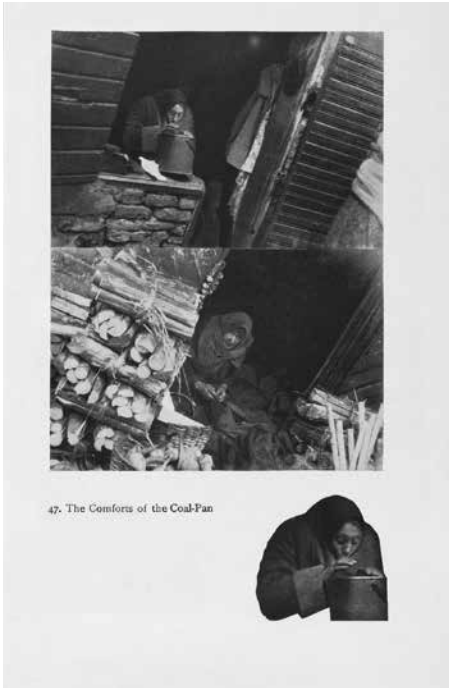
5. The Comforts of the Coal-Pan (Fig. 47).