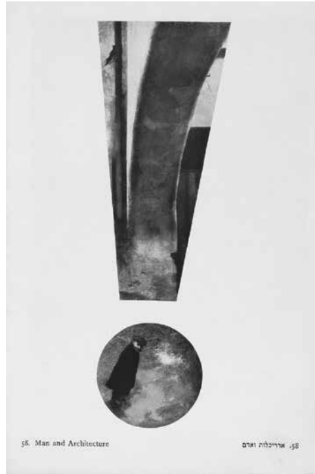
6. Man and Architecture (Fig. 58).