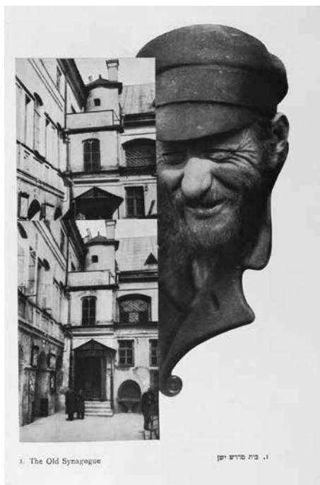
3. The Old Synagogue (Fig. 1).