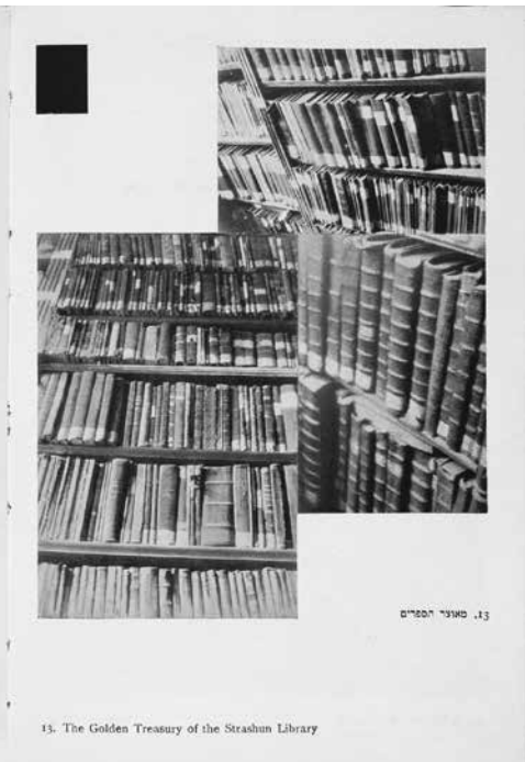
7. In Strashun Library. The Golden Treasury of the Strashun Library (Fig. 12, 13).