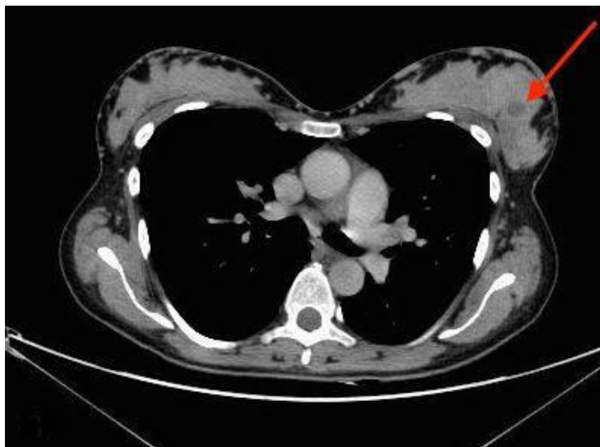
Fig. 4. On CT scan, a left breast mass with liquid density areas were visible

The patient received chemotherapy consisting of weekly paclitaxel and followed by adriamycin and cyclophosphamide. Signs of the breast mass destruction were recorded after two weeks of the treatment, which lead to the left modified radical mastectomy. Surgery was uneventful and the final report of the histology revealed invasive poorly differentiated G3 ductal carcinoma ypT3 (58 mm) stage pT3N3M0. After a surgical treatment, the patient