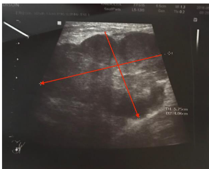
Fig. 1. An irregular-shaped tumour visible on ultrasound in the left breast

After a multidisciplinary case conference, it was decided to delay further radiological diagnostics until the delivery of the newborn at 37 weeks of gestation. After Caesarean section, breast magnetic resonance imaging (Figs. 2 and 3) and computed tomography (Fig. 4) were performed. On